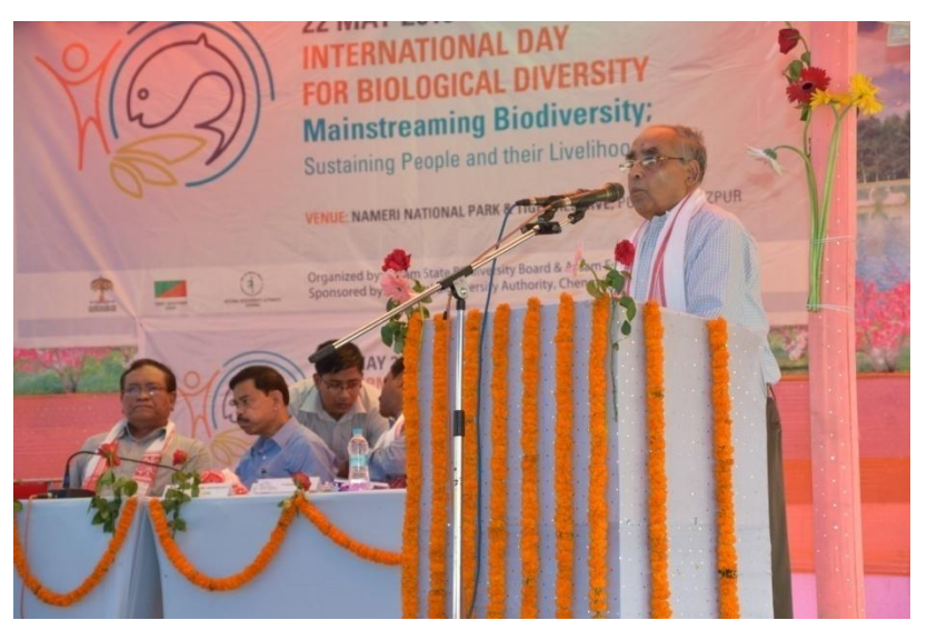
Speech by Chief Guest at the Function